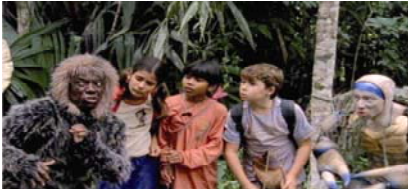
A Ilha do Terrível Rapaterra (The Island of the Earthbuster) 2006 / 80 min. / Adventure