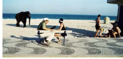
Copacabana (Copacabana) 2001 / 92 min. / Comedy