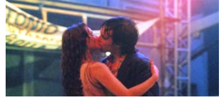
A Máquina (The Machine) 2005 / 94 min. / Romance